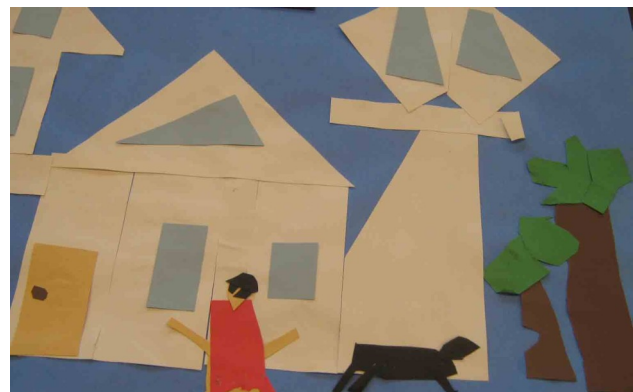
Modern Building by Joseph M. 3-4