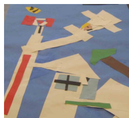
Building by Brody B.